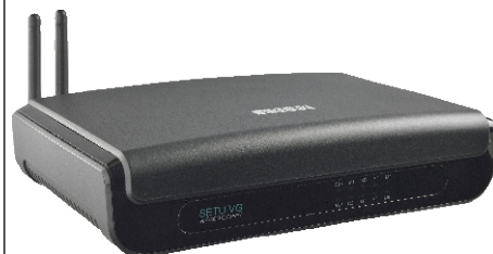
SETU VG Multi-Port VoIP to GSM Gateway